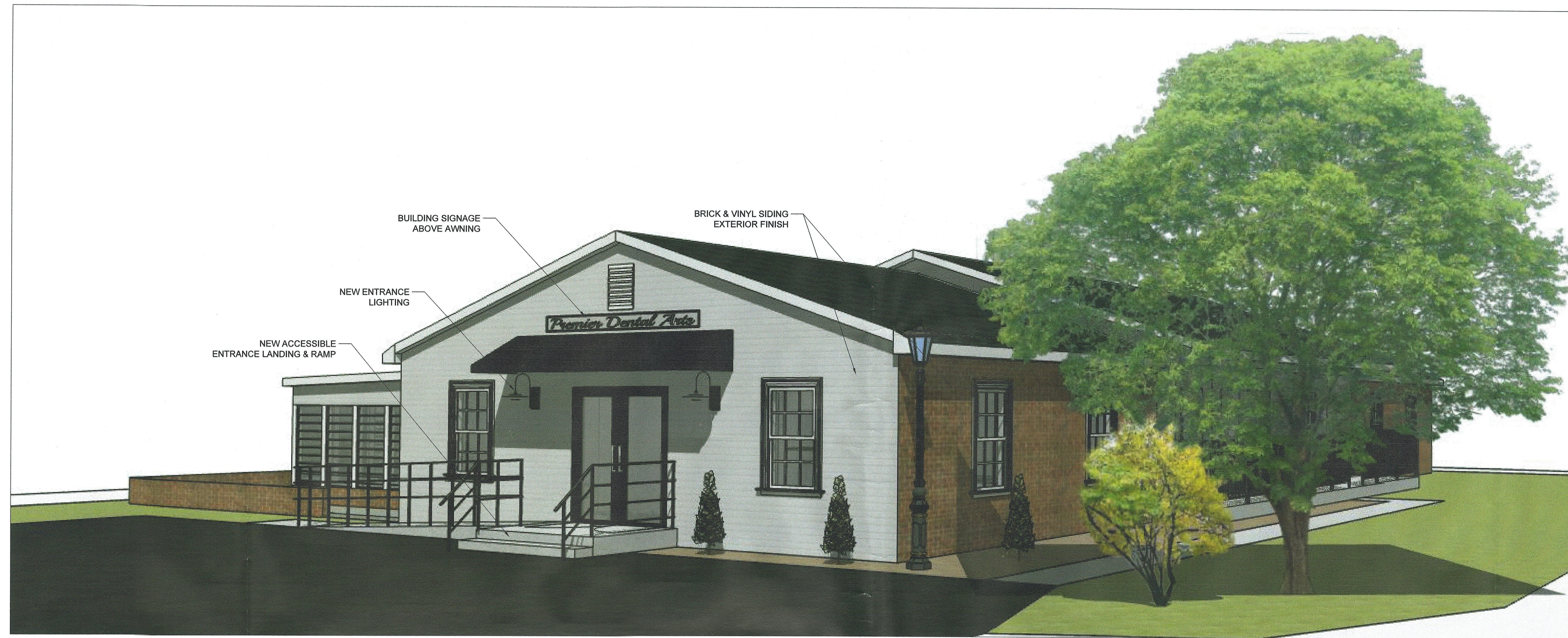
1 PROPOSED FRONT ELEVATION N.T.S.